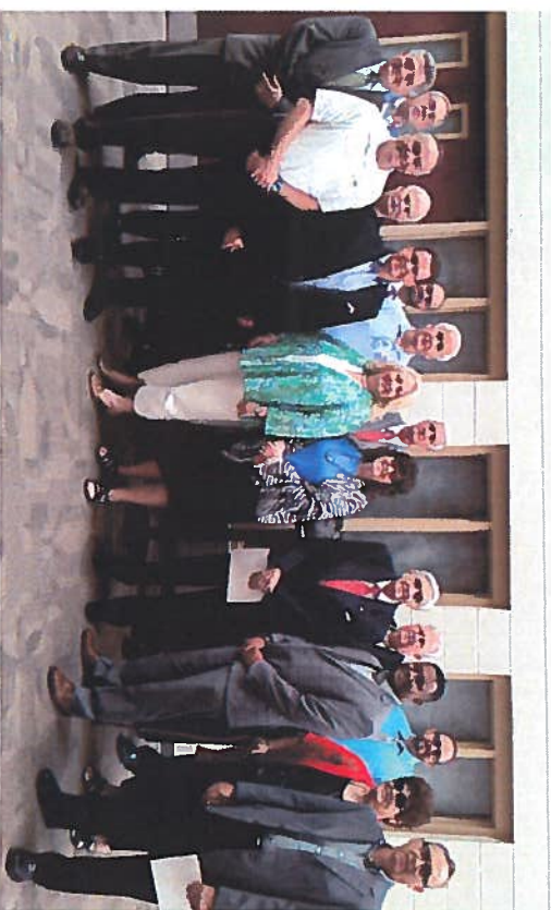
Pictured above: Local Ministers and Pastors involved in chaplaincy

For more information concerning chaplaincy ministry, contact the Tennessee State Executive Offices at: (423)892-4831 or go to www.cogtn.org or facebook.com/groups/1115168205180647/